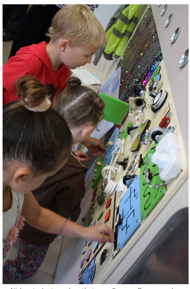
Nisley students explore their new Sensory Room, made possible by a grant from Alpine Bank and the D51 Foundation.

Visit d51schools.org/resources/bond_and_mill to learn more about the 2021 bond measure. ◆